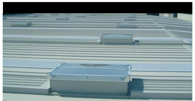
Panel roof type

Perfect lighting element as it perfectly adapts to both DECK and panel roof type.