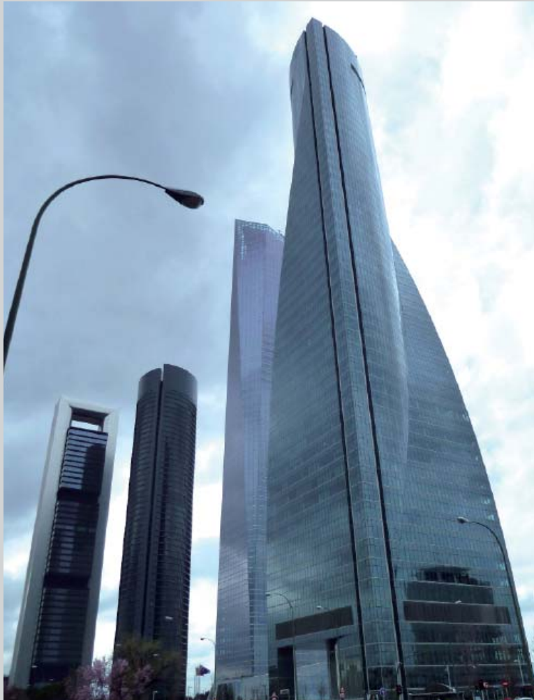
Cuatro torres, Madrid