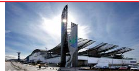
Hipercor ferial in Guadalajara