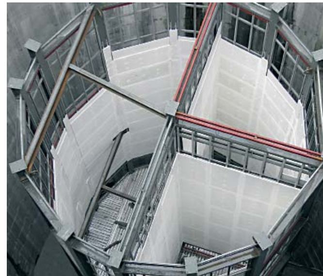
Ventilation BY-PASS M-30 south tunnel tanks, Madrid