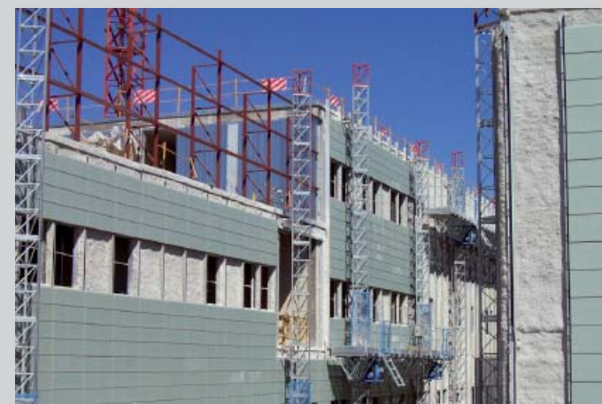
Infanta Sofía Hospital in San Sebastián de los Reyes, Madrid