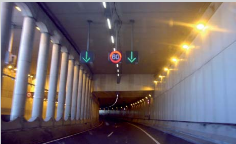
San Mamés Stadium new entrance tunnel, Bilbao