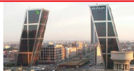
Kio Towers, Madrid