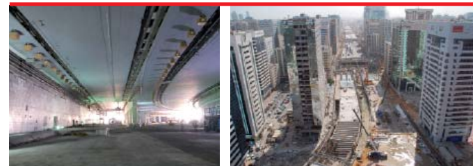
Al Salam Street Tunnel, Abu Dhabi