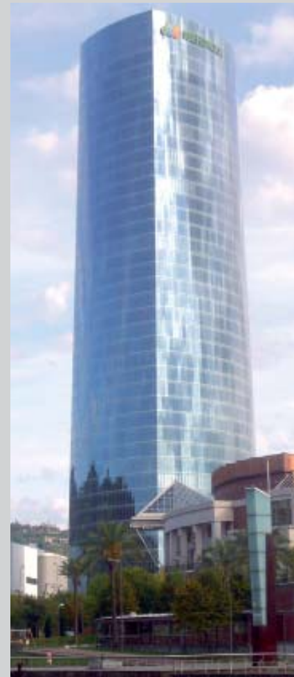
Iberdrola Tower. Bilbao