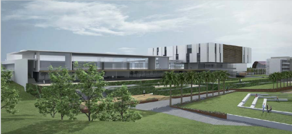
Catering and Hospitality School, Algiers