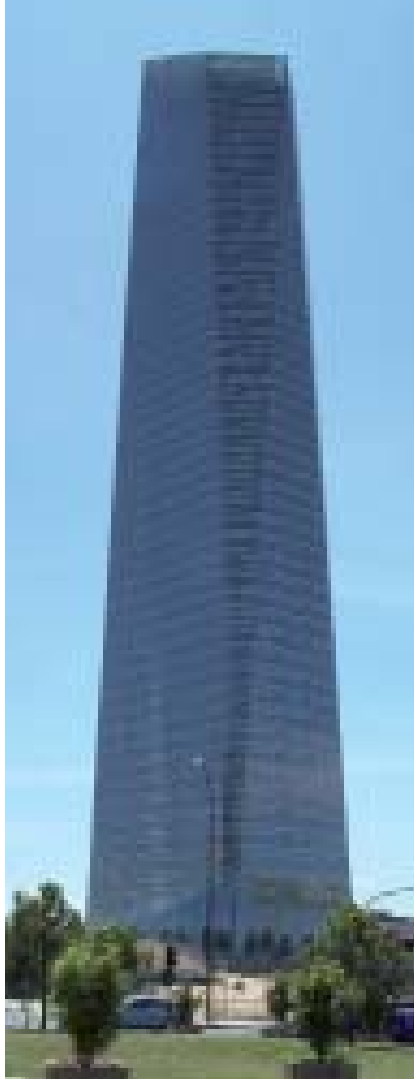
Cristal Tower, Madrid