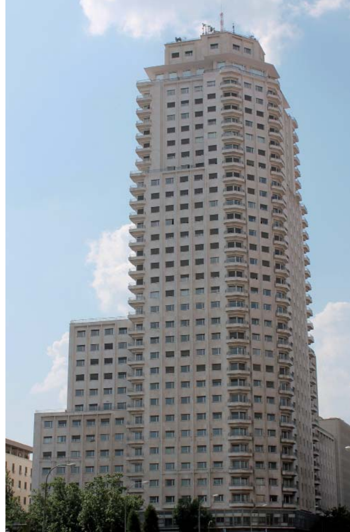
Madrid Tower, Madrid