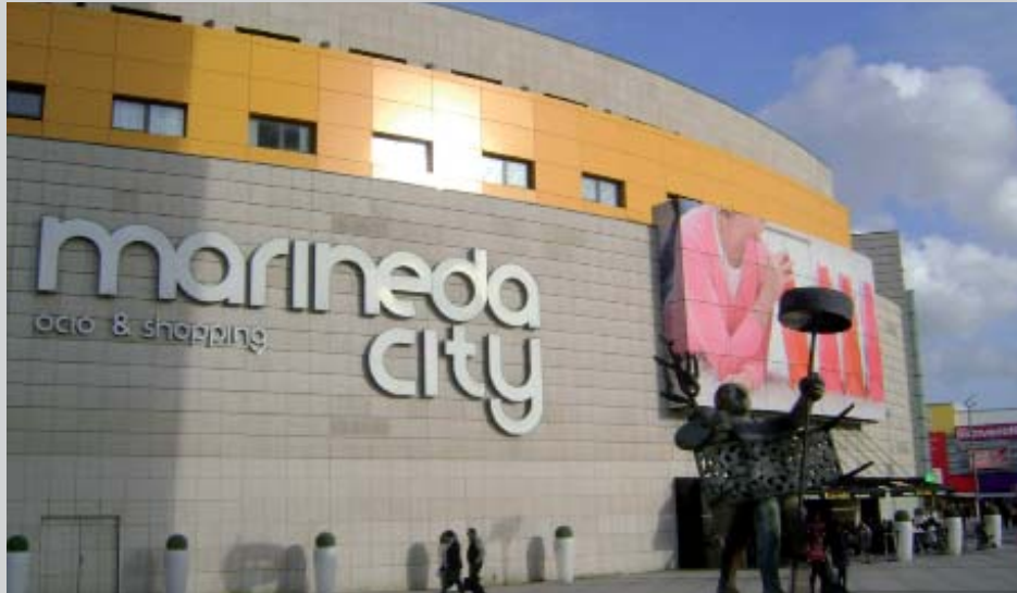
Marineda Shopping Center in A Coruña