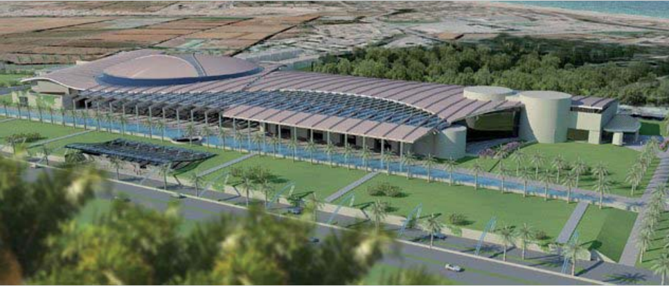
Conference International Center, Algiers