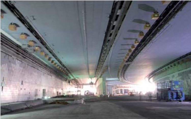
Al Salam Tunnel, Abu Dhabi

• Al Salam Street Tunnel in Abu Dhabi, U.A.E. • Al Ras Al Akhdar Tunnel in Abu Dhabi, U.A.E. • Baynoonah Street Tunnel in Abu Dhabi, U.A.E. • Midfield Terminal Tunnel in Abu Dhabi International Airport in Abu Dhabi, U.A.E. • Marina Coastal Expressway 482 Tunnel in Singapore • Polish Railway (PKP) Tunnel in Krakow, Poland • Bypass M-30 South Tunnel in Madrid, Spain • Bypass M-30 North Tunnel in Madrid, Spain • AVE-High Speed Railway Tunnel in Malaga, Spain • Commuting Railway Tunnel in Malaga, Spain • Ronda de Mig Tunnel in Barcelona, Spain • San Mamés Football Stadium, New entrance Tunnel in Bilbao, Spain • Terminal 4 Service Tunnel in Madrid Barajas Airport in Madrid, Spain • Metrosur Tunnel in Madrid, Spain • Sevinnes tunnel in Paris, France • Smestad Tunnel in Oslo, Norway • Vías Nuevas Tunnel in Lime, Peru.