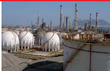
CEPSA Refinery, Gibraltar