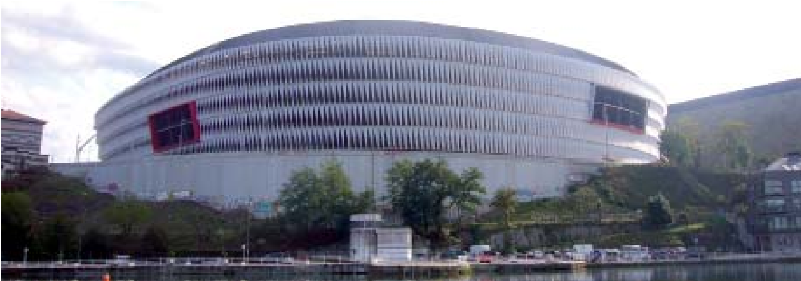
San Mamés Stadium, Bilbao