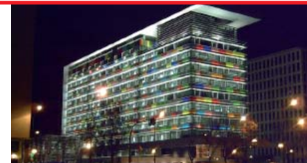
Statistics National Ins. Headquarters, Madrid