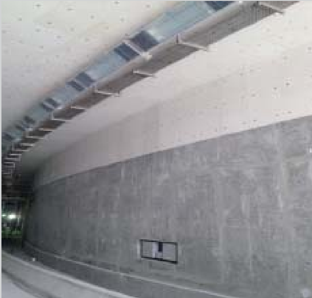
Al Ras Al Akhdar Tunnel - Baynoonah, Abu Dhabi.