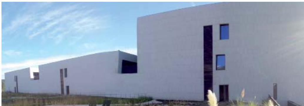
Collado Villalba Hospital, Madrid

• Infanta Sofía Hospital in San Sebastián de los Reyes, Madrid • Móstoles New Hospital, Madrid • 12 de octubre Hospital, Madrid • Collado Villalba Hospital, Madrid • Puerta del Hierro University Hospital of Majadahonda, Madrid • New Hospital, Burgos • La Fe Hospital, Valencia • Marques de Valdecilla University Hospital, Santander • A Coruña Hospital Complex (Juan Canalejo old one) • Manises Hospital, Valencia • Clinic University Hospital, Valladolid • Montecelo Hospital, Pontevedra.