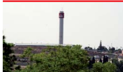
BSCH Financial City, Madrid