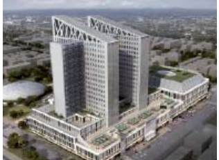
Sètif Park Complex, Sètif