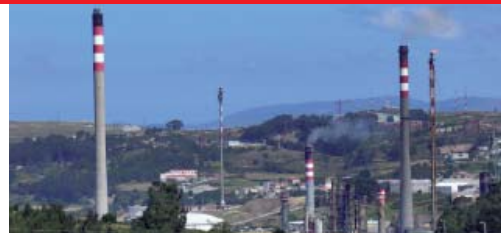
REPSOL Refinery, A Coruña