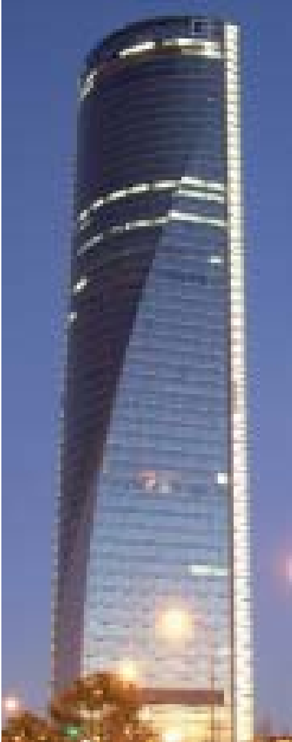
Espacio Tower, Madrid

More than 700.000 m 2 of built gross area.