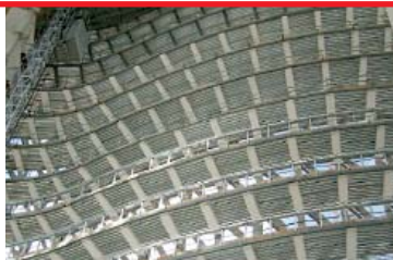
Expozaragoza 2008. Agua Tower