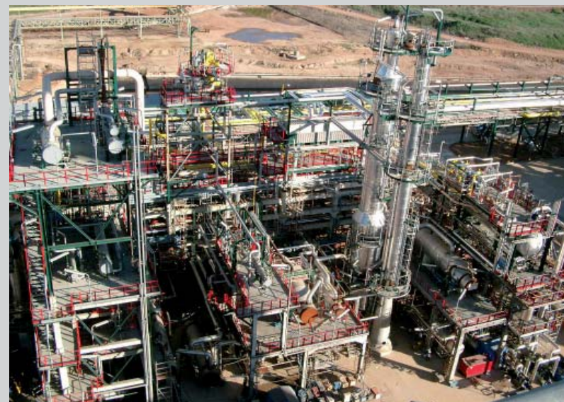
REPSOL Refinery in Puertollano, Ciudad Real