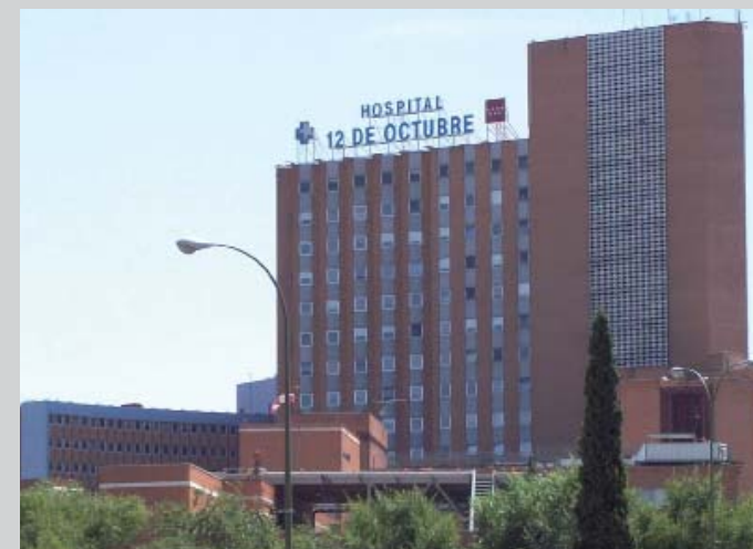
12 de Octubre Hospital, Madrid