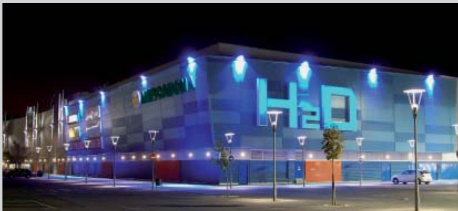
H2O Ocio Shopping Center, Rivasvaciamadrid